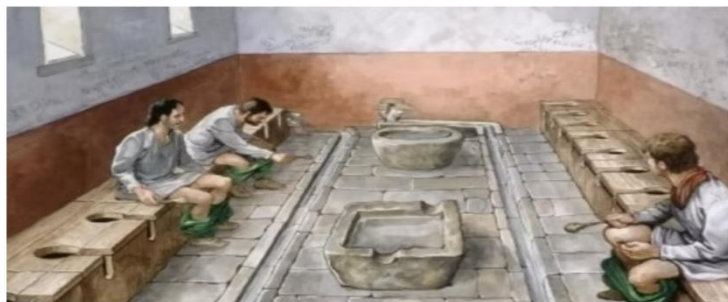
The Roman Lavatory at Housesteads Fort ... reconstruction.

'O Cloacina, Goddess of this place, Look on thy suppiants with a smiling face. Soft, yet cohesive let their offerings flow,