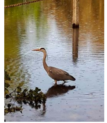
Heron in River Wandle Carshalton