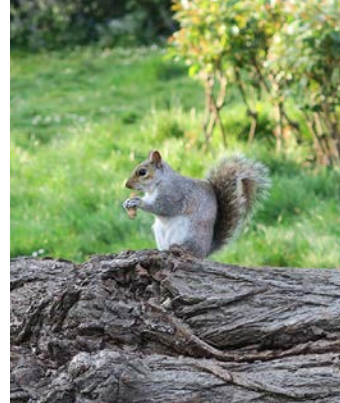
Squirrel on Wilderness Island, Carshalton