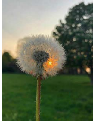
Morning at Wakehurst National Trust