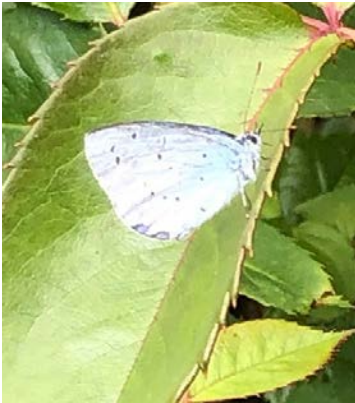
Blue Holly butterfly in Highbury View