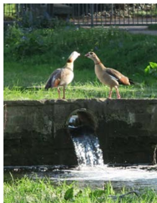
Ducks in River Wandle ignoring 2 metres rule!