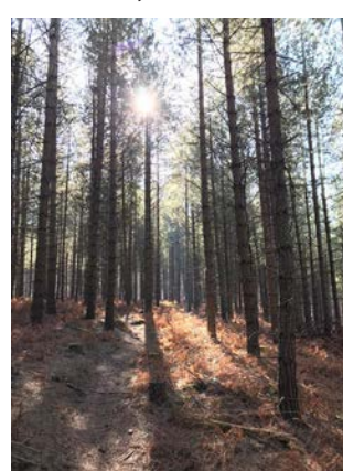
Morning in Winterfold Wood