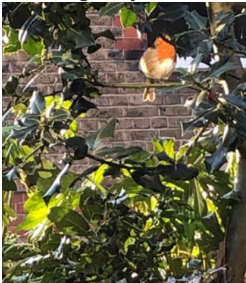
Robin in Highbury View near Bronwen's back door