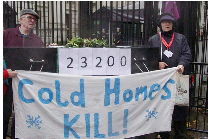
NPC London Region demo at Downing Street

We need the next government to roll out a more effective programme to insulate homes, building more suitable properties for older people and raising the winter fuel allowance in line with inflationary costs of energy.”