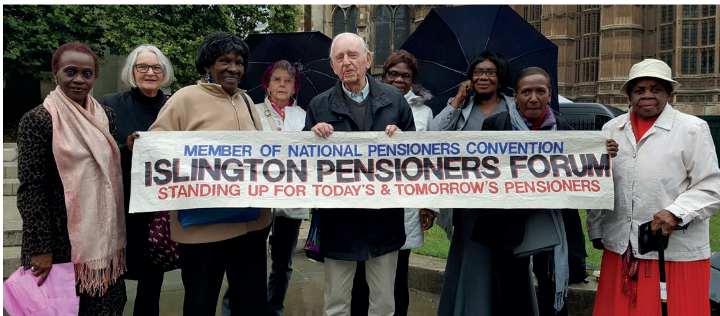
The 14-strong IPF delegation at the National Pensioners Convention parliamentary Lobby on 18 October.