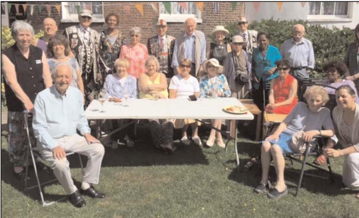
Members of Islington Pensioners Forum with Highbury View tenants and the Pearly Kings at the very warm and sunny garden party with a great buffet and swinging music on 27 May.