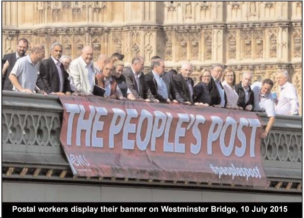
Postal workers display their banner on Westminster Bridge, 10 July 2015

Postal workers say: "it always has been and must remain, the People's Post".