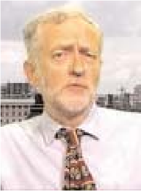
Jeremy Corbyn MP