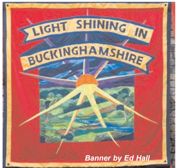
Banner by Ed Hall

The production lives up to the dramatic historic events which have a resonance today when we are campaigning in defence of the post Second World War gains, especially the NHS, and thousands are marching against austerity and privatisation.